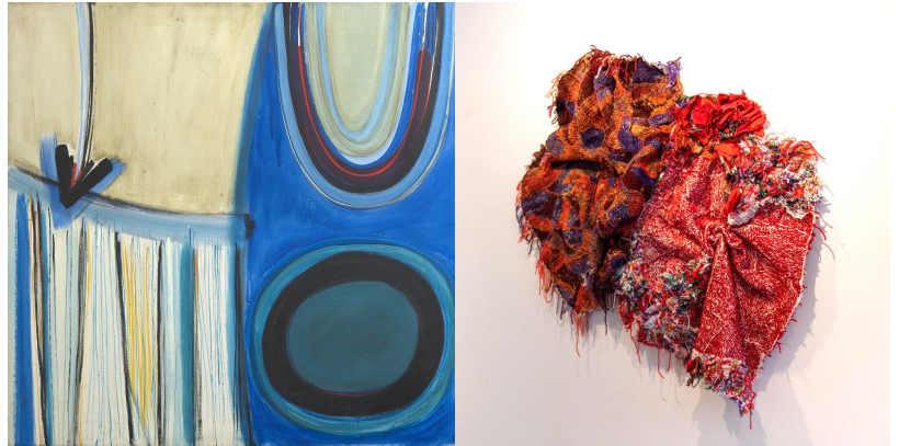
Sir Terry Frost 'Red, Black and Blue Arrows' 1962. Courtesy of Osborne Samuel LAF; Georgina Maxim 'Two hearts in one' 2022 textile and mixed media. Courtesy Koop Projects LAF